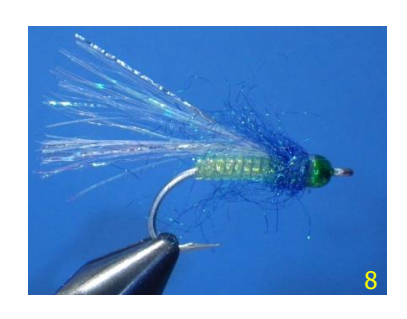
7ight Lines & Good Luck!

Place a split drinking straw over your thread and slide back over the collar, then place some head cement on the thread and whip finish. After cutting your thread remove the straw and using Velcro pick out a little of the Ice Dub.